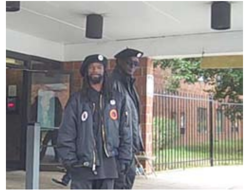
Panthers caught on video tape.